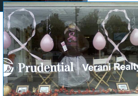
Front window of the Exeter Office.